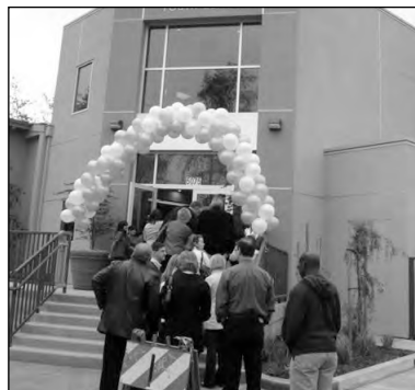
Visitors line up to tour the Everychild Foundation Youth Center after its dedication on Saturday, March 14.